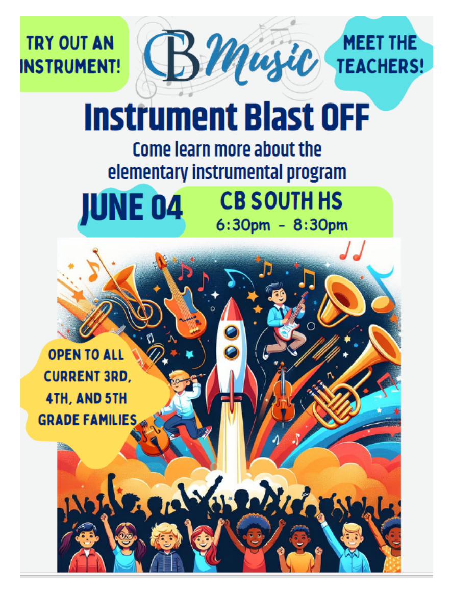
After School Opportunities